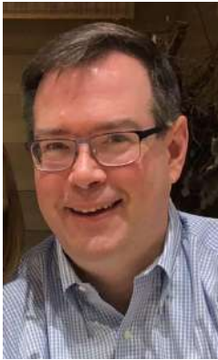
By Rowen Bell

Here's a card play principle to keep in mind: When facing a choice between two seemingly equivalent lines of play, choose the one that gives the opponents an opportunity to make a mistake.